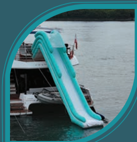
Giant Slide $400