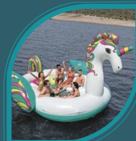
Giant Unicorn $200