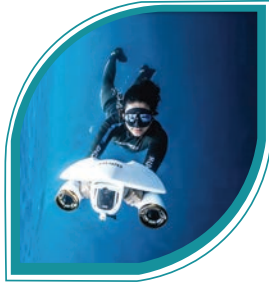
Subblue Underwater Scooter