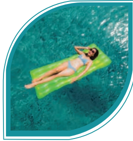
Float for single pax (seasonal)