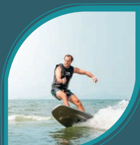
E Foil $500