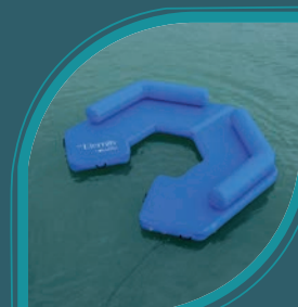
Inflatable Floating Island $150