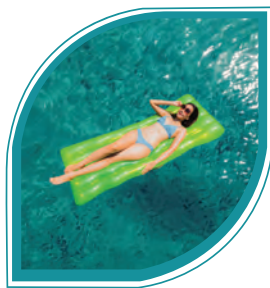
Float for single pax (seasonal)