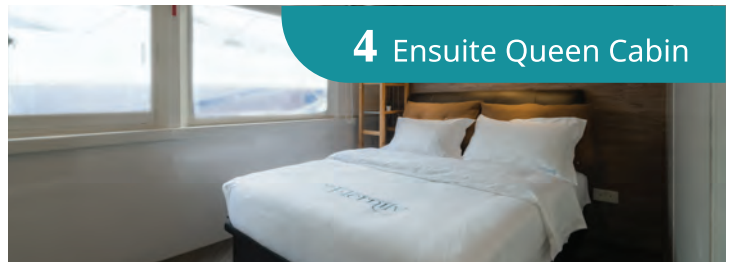
4 Ensuite Queen Cabin