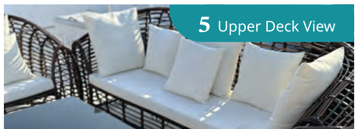
5 Upper Deck View