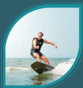
E Foil $500