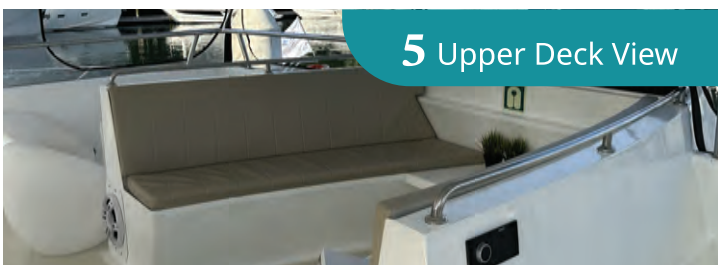
5 Upper Deck View