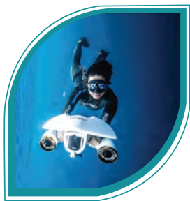
Sublue Underwater Scooter