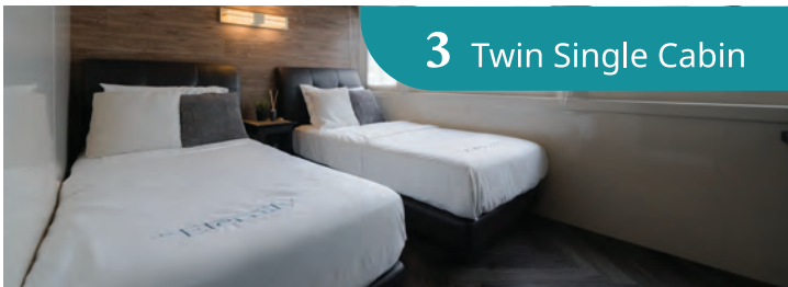
3 Twin Single Cabin