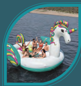
Giant Unicorn $200