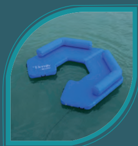
Inflatable Floating Island $150