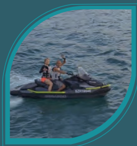
Jet Ski $550