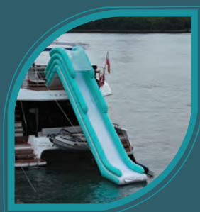
Giant Slide $400